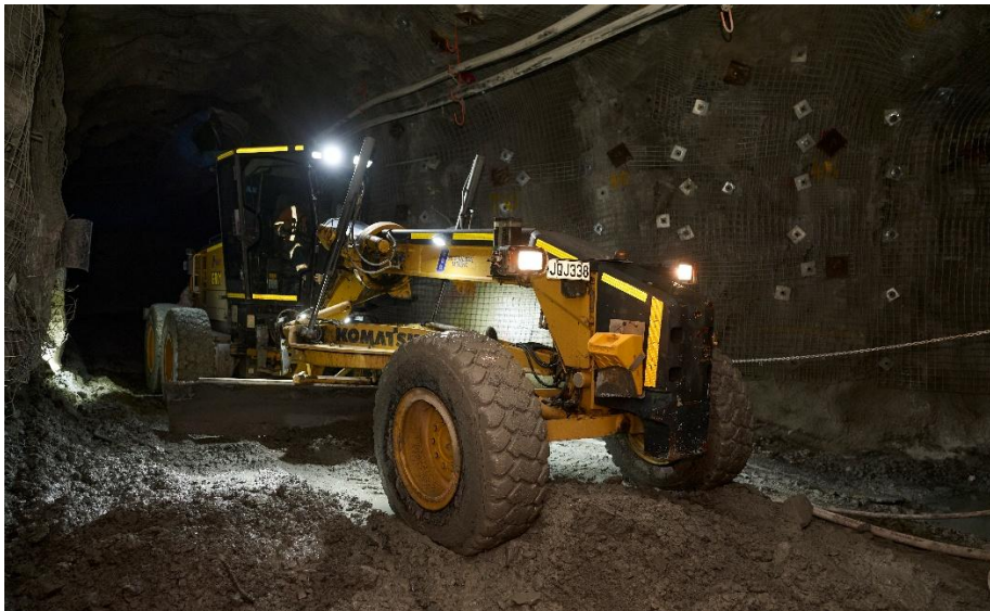
Photo – Underground road maintenance operations