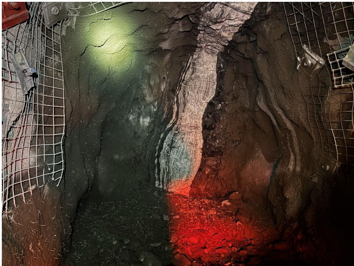
Photo – Birthday Reef