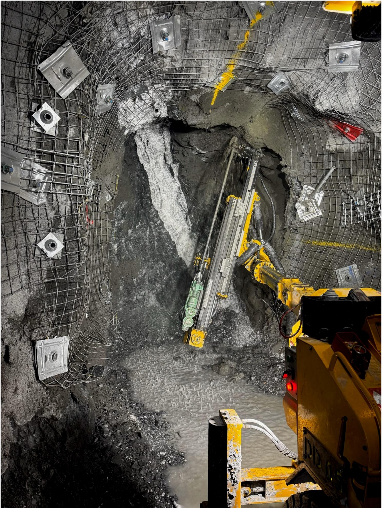
Photo – Single boom jumbo accessing the Birthday reef in ore drive