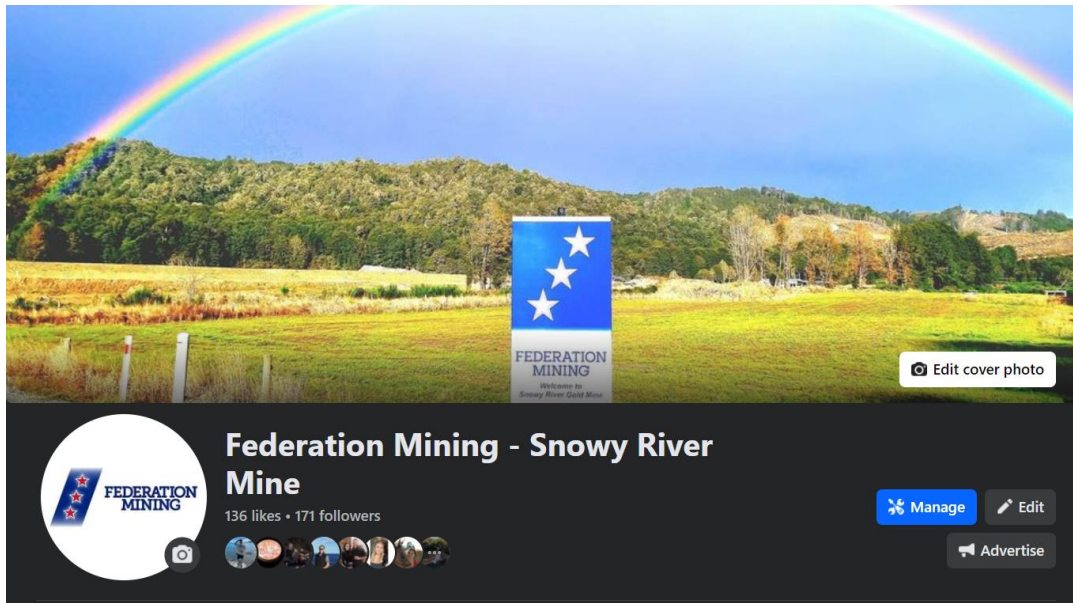
Photo above - Federation Mining joined FaceBook during July you can follow at FaceBook Link