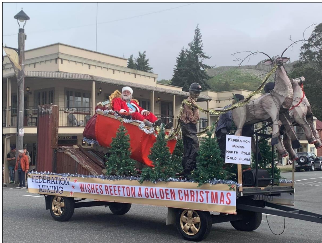
Christmas on Broadway, Federation Mining float

Crews enjoyed end of year celebrations on site with Christmas BBQ's held with each crew.