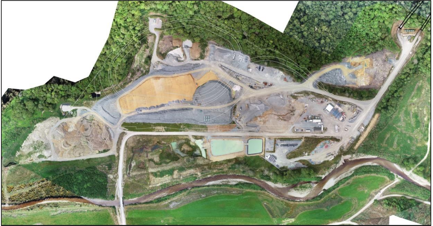
Snowy River Site – Drone image December 2023