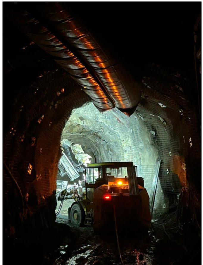
Underground workers – Snowy River Mine