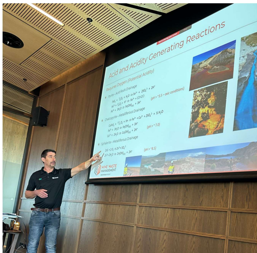
Mine Water workshop