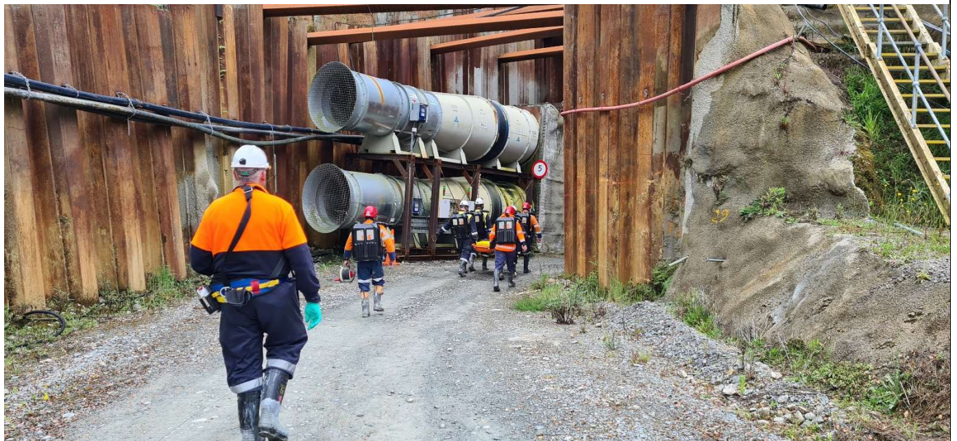
Photo - NZ Mine Rescue exercise