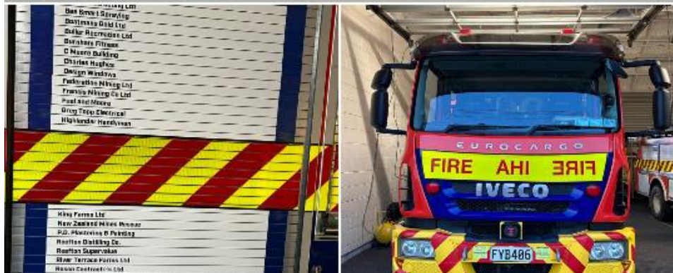
Federation is pleased to be noted on the Reefton Fire Brigade along with other supportive employers of volunteer fire fighters