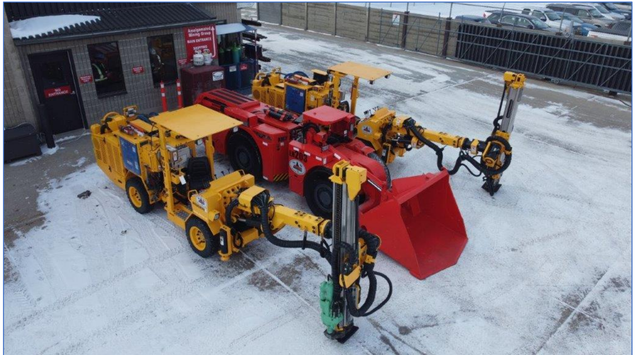
Narrow Vein Mining equipment prepared and ready for shipment in Canada