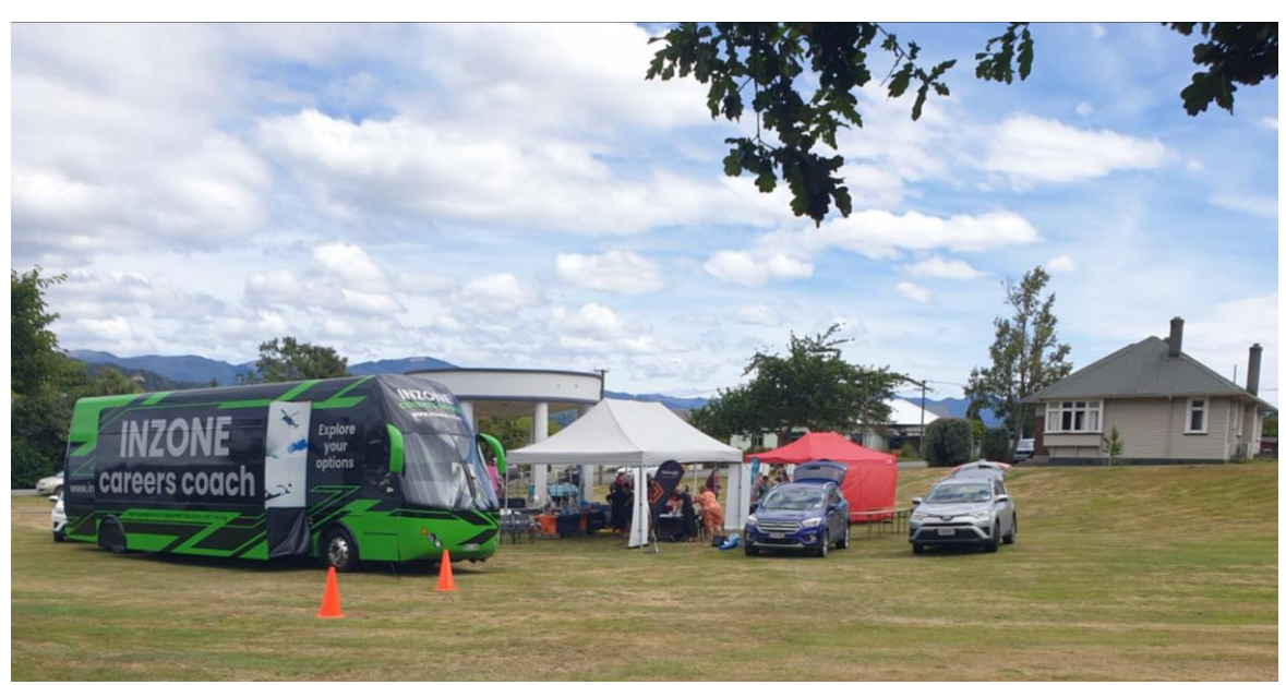
Careers Fair in Reefton