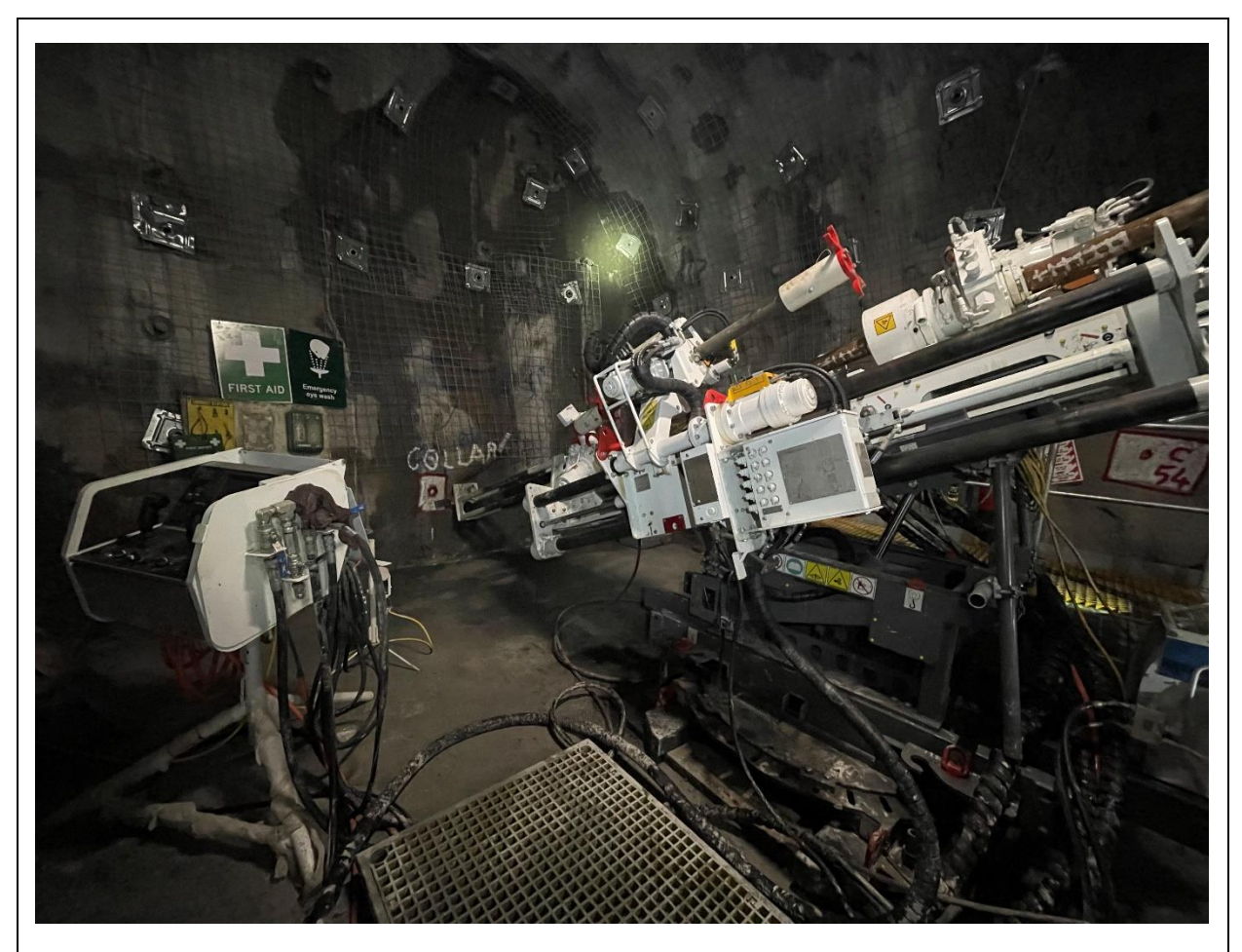
Diamond Drill Rig underground at Snowy River