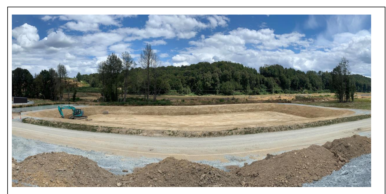
Sediment Pond – Clay liner now completed