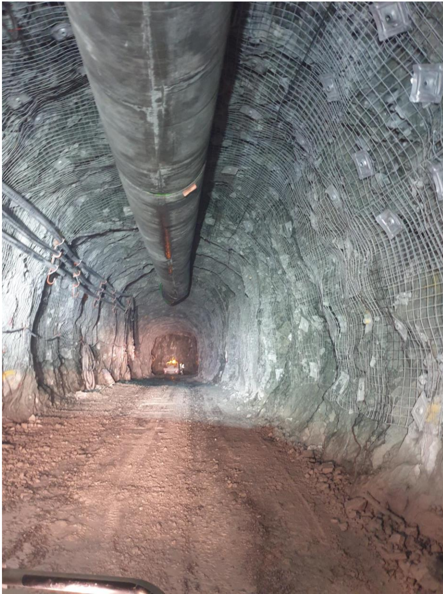
Underground at Snowy River