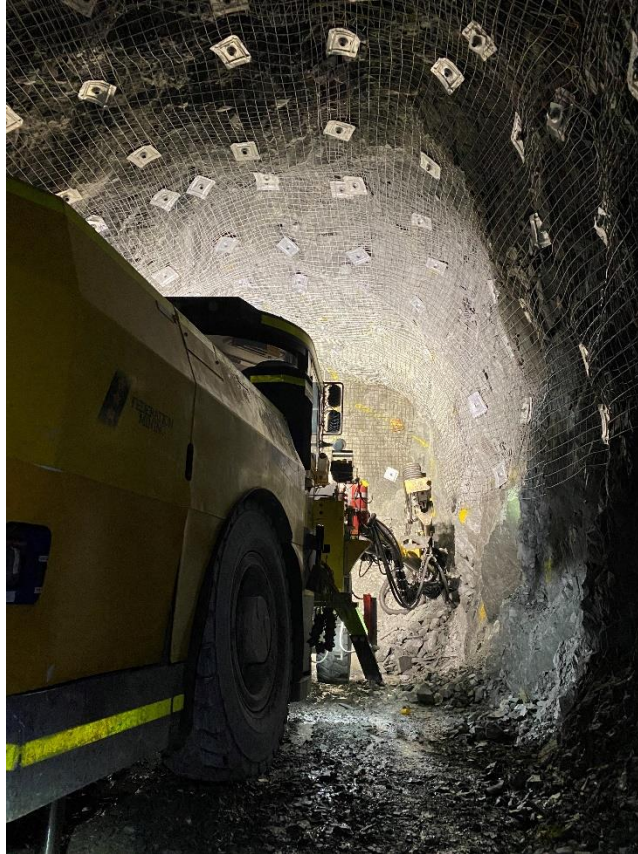
Jumbo operations in the main decline