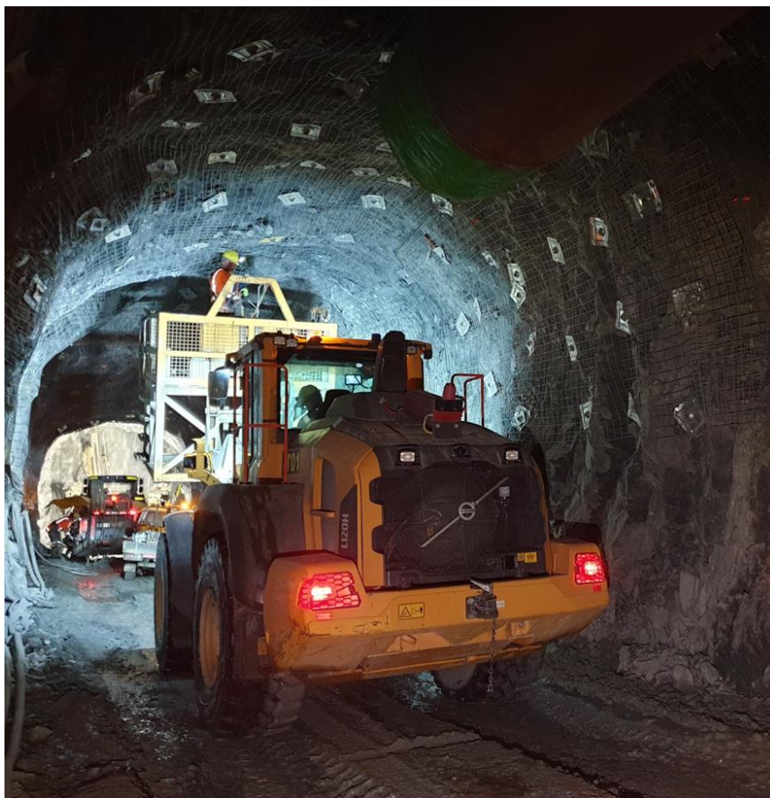
Services installation in the decline