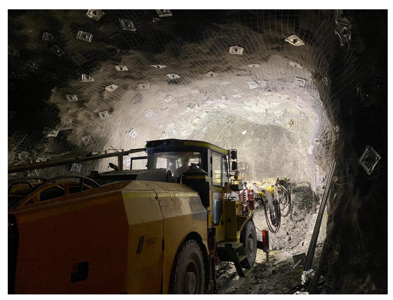
Epiroc Jumbo working in the Main Decline