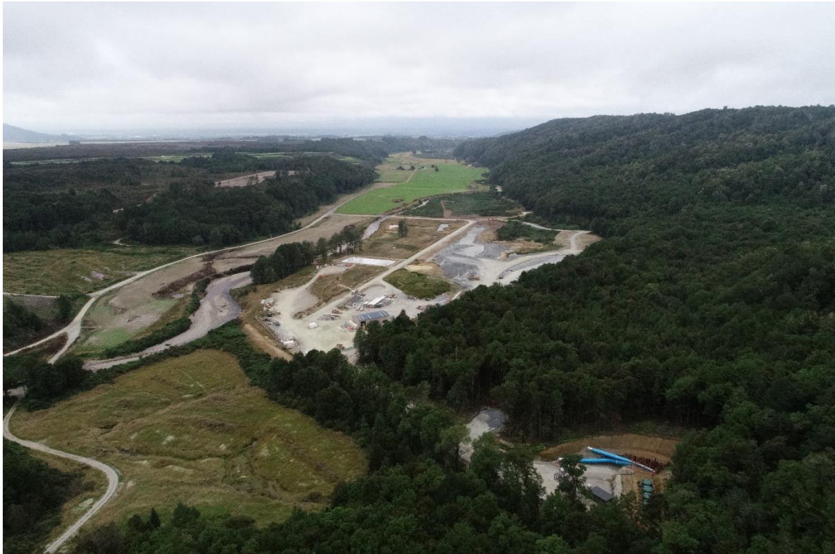
Drone view of Snowy River Mine site