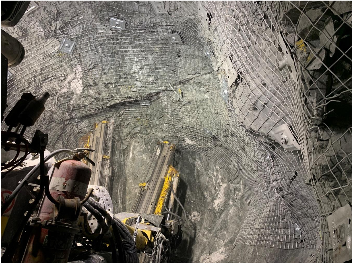
Jumbo drill bolting in cross-cut 7