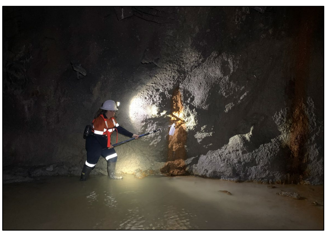
Water sampling underground