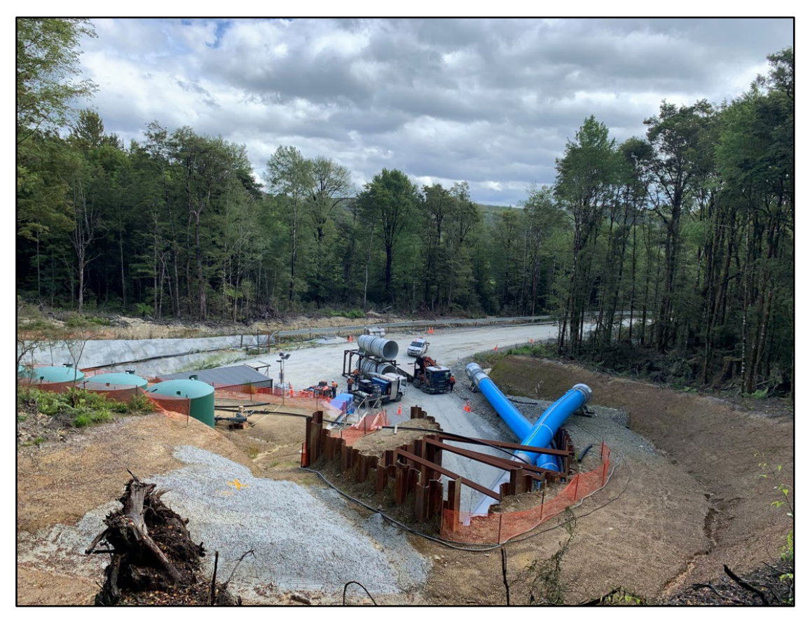
Portal works for the installation of the Primary Fan

\stackrel{\bigstar}{\bigstar}_{\bigstar}