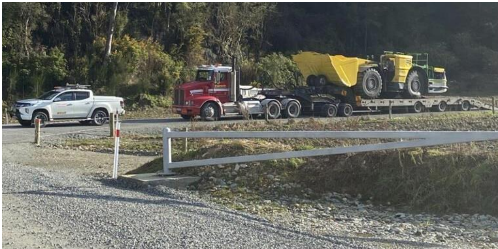
Photo above - Second Epiroc ST18 Loader arriving to site