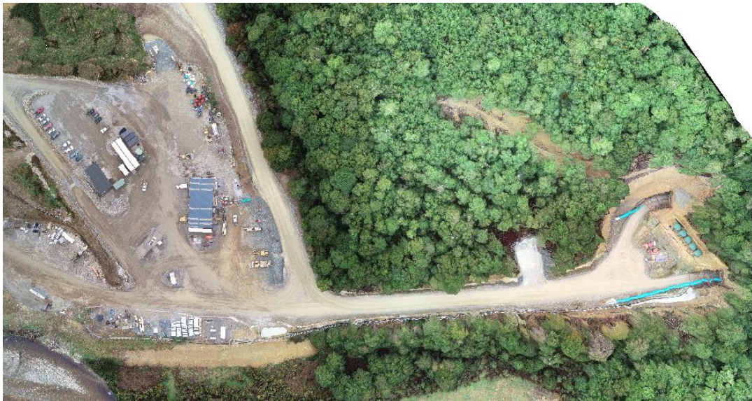
Aerial Photo of the Snowy River Mine Site