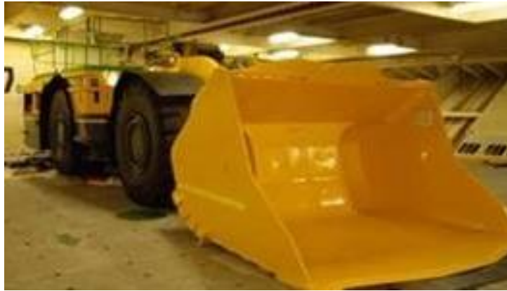
Second Epiroc ST18 Loader on board a ship bound for New Zealand