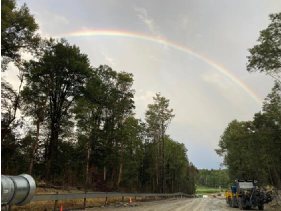
Site photo looking from the Main portal entrance