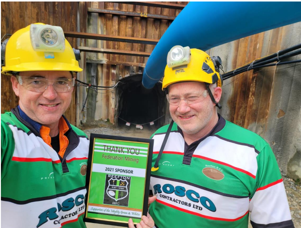
Federation proudly sponsors the Reefton Rugby club and a number of our employees also play for the club