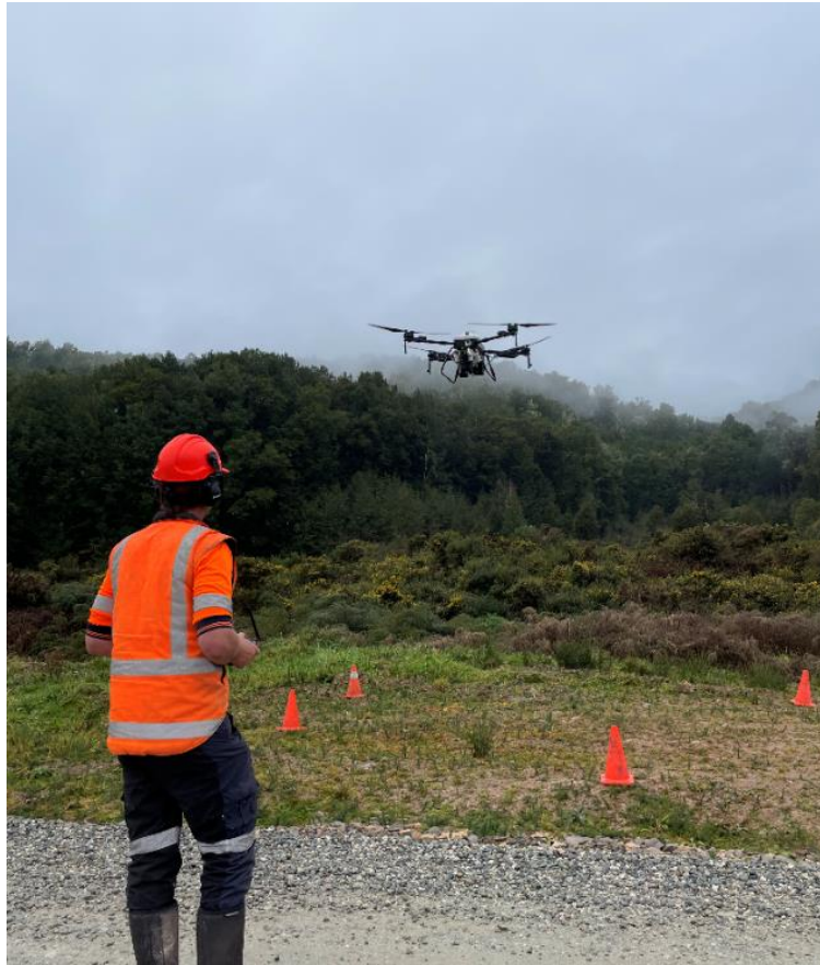
Weed spraying operations using a drone