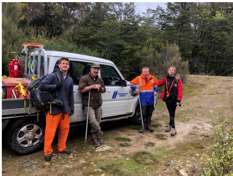
Exploration Field team