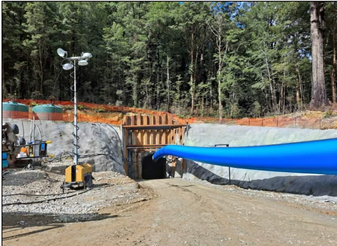
Photo 2 - Main Portal Entry