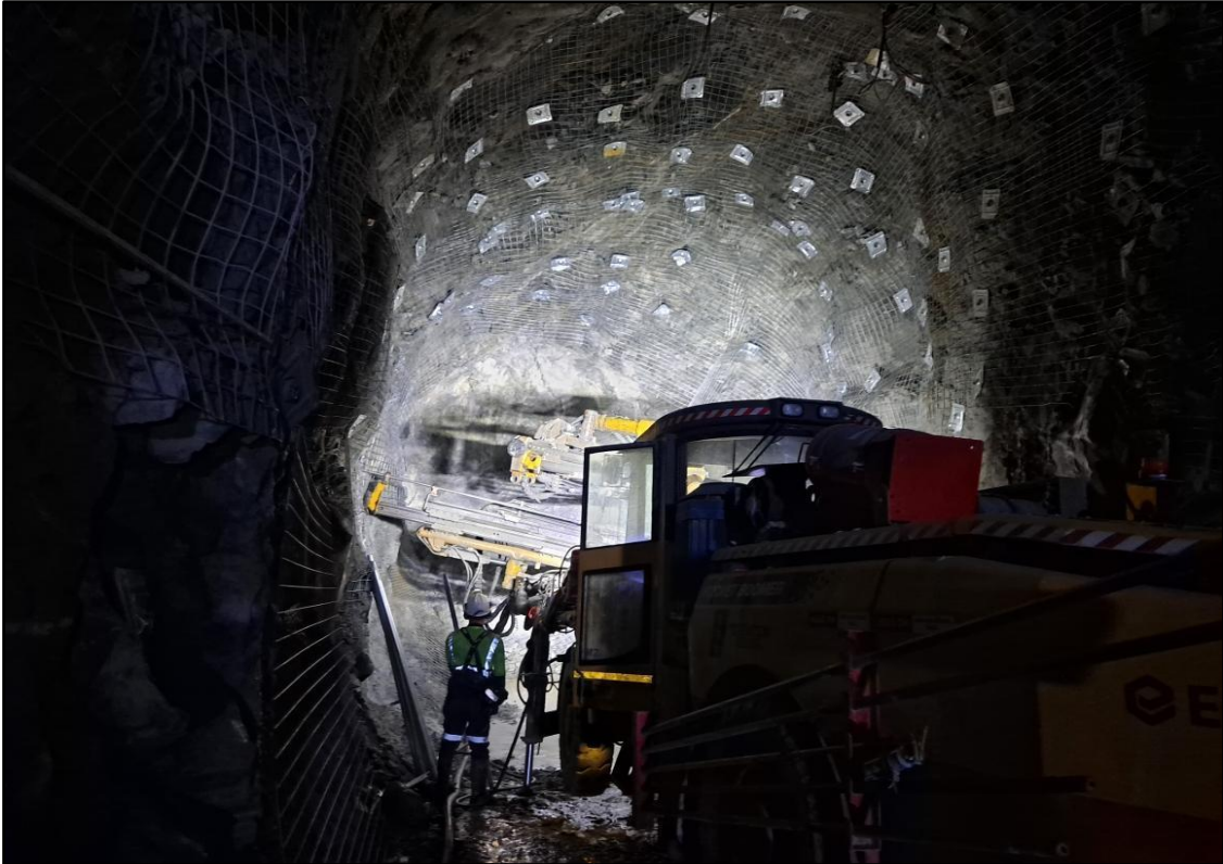
Photo 1 - Main Decline