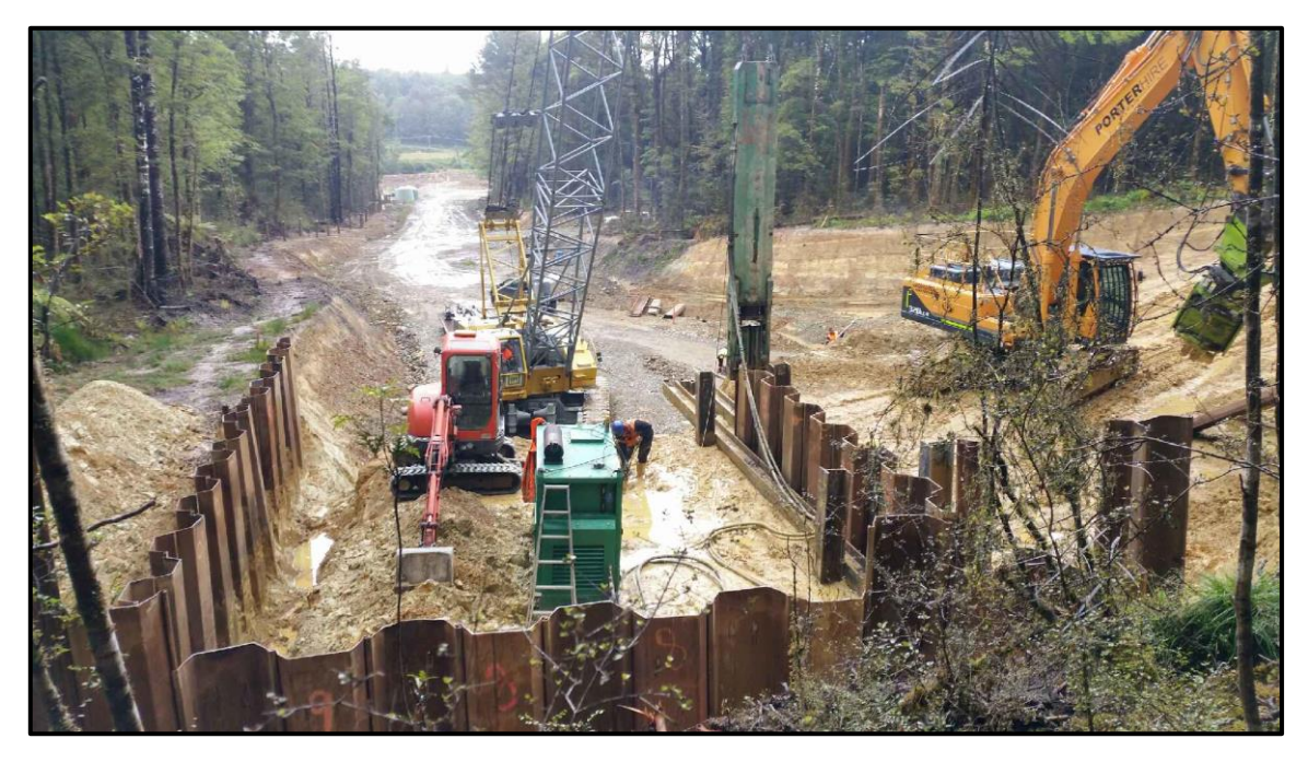
Main Tunnel Sheet piling in progress in mid-November