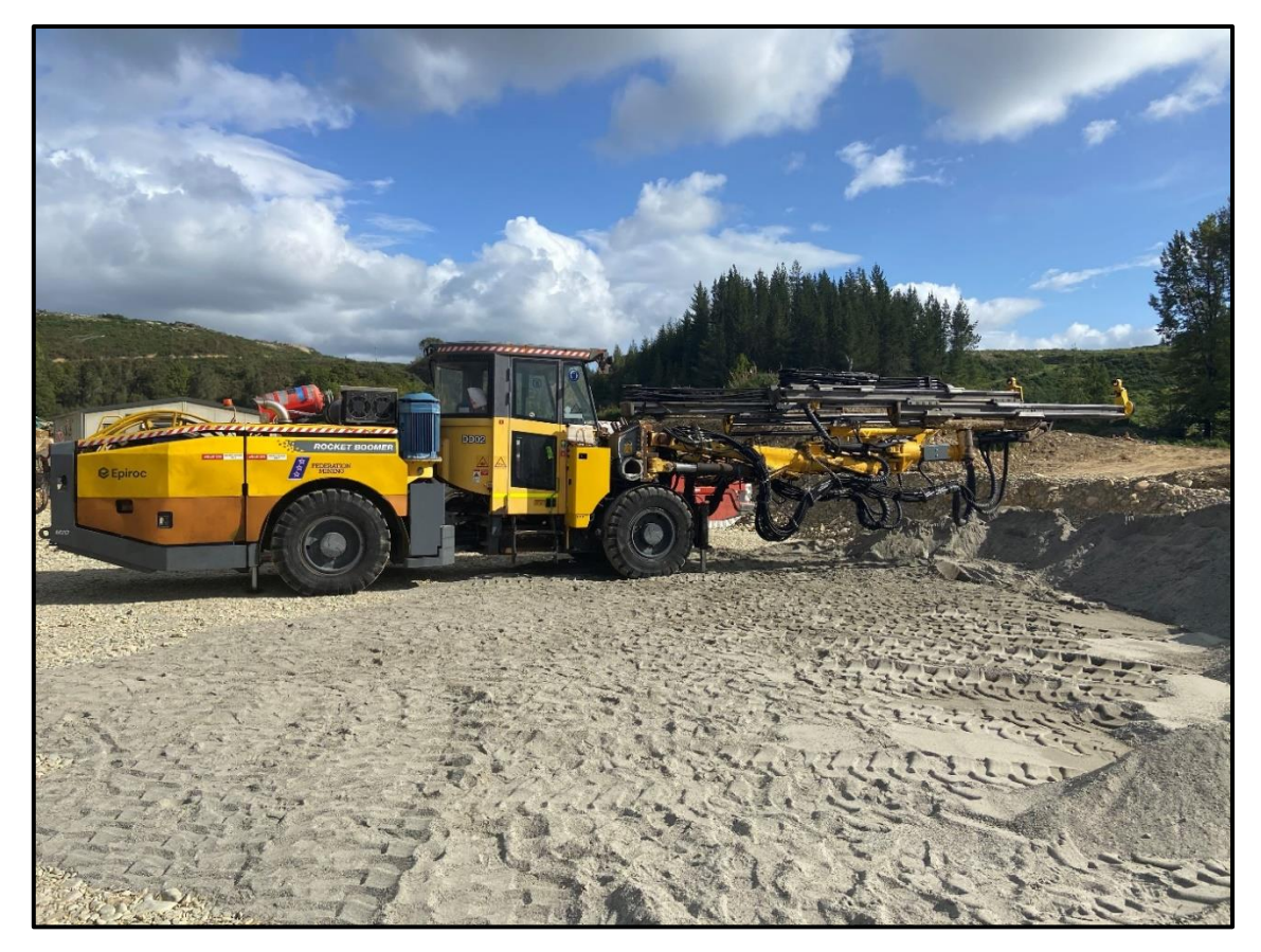
Refurbished Epiroc Jumbo Drill arrived onsite the 27^{\mbox{\tiny th}} of November