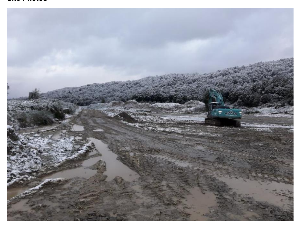
Site earth works underway onsite preparing for surface infrastructure installation